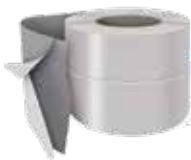
STARTEX TAPE BT Self-adhesive waterproofing butyl strip