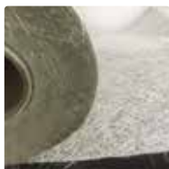
STARTEX NW Non-woven fabric